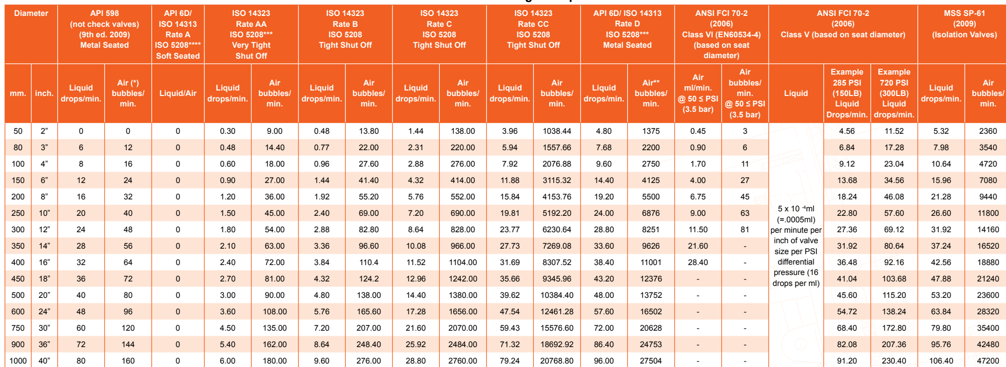
Table 7 - Common Isolation Valve Leakage Comparison Metal vs Soft Seat

API 6D corresponds to ISO 5208 - 2008 leakage rates, ISO 5208 in turn corresponds to EN 12266-1 leakage rates but only for class A, B, C, D, E, F & G